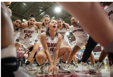
Athletics & Sport Clubs

We're counting on you to help make this year the biggest Giving Day yet! Gifts to any area of any amount count, and with over 80 featured causes, we know you'll find one to match your passion. Browse our causes by area of interest or click to view them all.