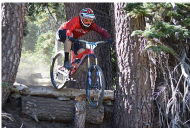
Sport Clubs & Athletics