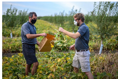
Sustainability & the Environment