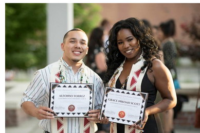
Equity, Diversity, & Inclusion