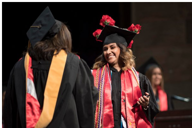
Equity, Diversity, & Inclusion