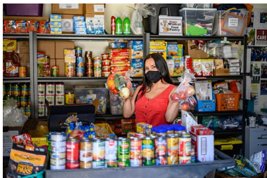
Student & Program Support