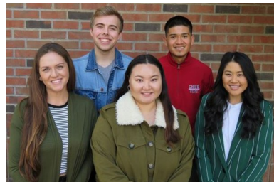
Scholarships & Awards