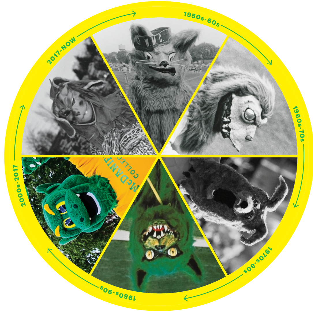
Circle Wheel (inside)