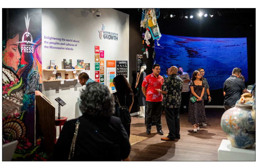
Grand opening of the UOG 70th Anniversary Exhibit at the Guam Museum (August 19, 2022).